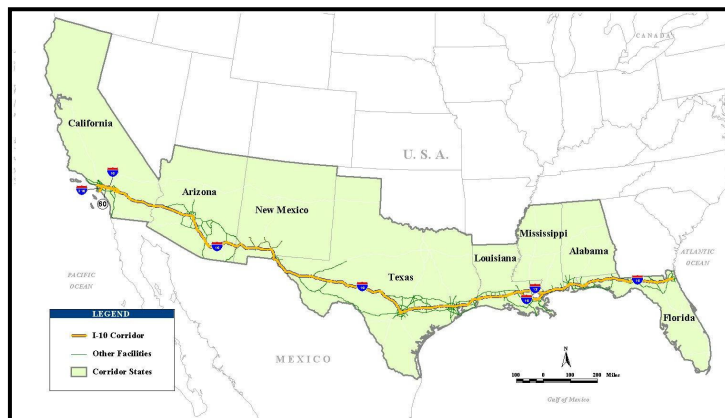
Exhibit 1: The National I-10 Freight Corridor